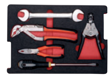
Aviation Tool Box: Additional Tray